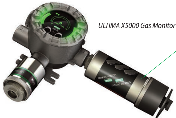
ULTIMA X5000 Gas Monitor

(XIR PLUS SENSOR SHOWN) DUAL SENSING CAPABILITY FOR ANY COMBINATION OF SENSORS